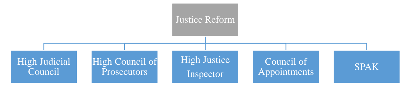
Figure 2: The organizational chart of the Institutions amended by the Justice Reform

negotiations with Albania in March 2020. The Reform scope is focused in three main directions: (i) Anti – corruption efforts compressed of the Vetting process for all sitting magistrates, establishment of permanent structures combating corruption and lifting of immunity regarding criminal investigations against magistrates; (ii) Accountability institutionalized by presenting a modern disciplinary system for all magistrates , ensuring heterogenous composition of the High Judicial Council and High Prosecutorial Council (lay members inclusivity) and establishing a sing body to carry out the disciplinary actions against magistrates -the High Justice Inspector; and , (iii) Access to Justice by addressing a new legal aid system. Having said this, understandably the structures that were established to implement the reform are of vital importance for the legal process in Albania. In this paper, appointments made in these structures will be analyzed and provide a gender-participation as reflected in the members' composition. Figure no.1 reflects the structural organization of the institutions that are reformed by the Justice Reform: